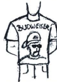
No profane/vulgar, discriminatory words/pictures or references to drugs/alcohol